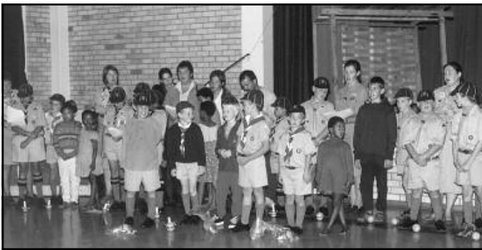
CHRISTINGLE SILENT NIGHT, HOLY NIGHT...